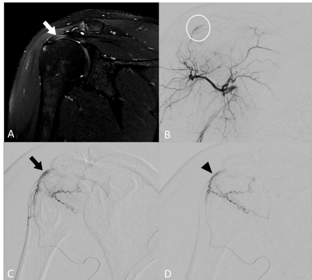
Figure 1. Image of a 46-year-old patient with rotator cuff tendinobursitis refractory to conventional treatment. (A) On baseline coronal T2 fat-sat MR imaging, injury appears as a hypersignal of supraspinatus tendon (white arrow). (B) The digital subtracted angiography (DSA) from the ostium of the posterior circumflex humeral artery confirmed pathological neovessel development in the area supplying the supraspinatus tendon (white circle). (C) DSA after selective microcatheterization of the pathological branch confirmed the “tumor-like” blush (black arrow). (D) DSA after embolization using microspheres demonstrated a decrease in the vascular blush (black arrowhead) that persisted, considering that the collaterals may be at risk of non-targeted embolization complications.