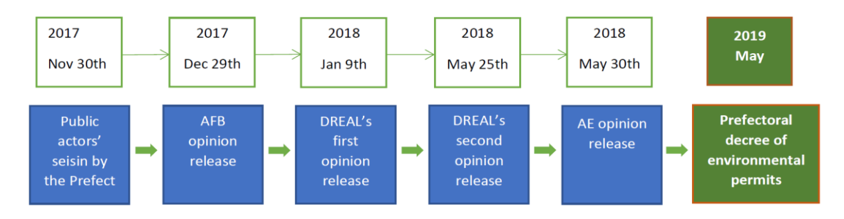
< Figure 5#> Timeline of opinions releases of the three main actors highlighting the Benthos.

Thie timeline (Fig. 5) shows 1) the temporal evolution of interactions that are not static in time and 2) the impact of these temporal trajectories on the processes of interactions in-the-making. DREAL released two times its opinion, the first one expressing its reserves and the second one after the responses of the industrial project leaders, to confirm its positive opinion. OFB, DREAL and Ae finally released a positive opinion to the OWF project, but with technical and scientific reserves. The reactions of the project developers (Eolfi-Shell and RTE) to the first strong opposition from OFB and DREAL and the adjustment measures negotiated within the network have led to a progressive shift in the positions in favor of obtaining environmental permit.