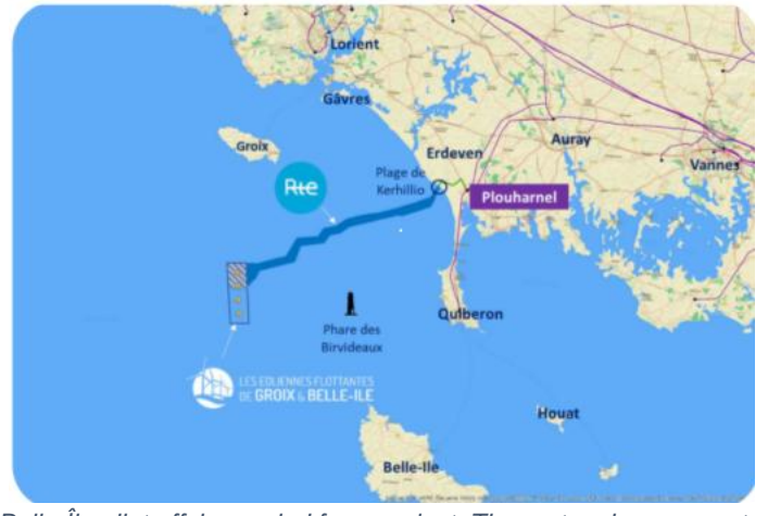
<Figure 2#>: The Groix & Belle-Île pilot offshore wind farm project. The rectangle represents the offshore wind farm area with the three offshore wind turbines located off the two islands of Groix in the North and Belle-Île in the South. The electrical connection is illustrated by the dark blue line.

In the last ten years, French policies have tackled climate change by establishing a national time frame to foster the development of renewable energies in the national energy mix. In particular, OW has become central to this political strategy. Within the national scheme, Brittany Region has partly oriented its territorial development toward OW energy. With the technical support of recent innovations (floating wind turbines (Rogier 2019), wind generators and float efficiency), the financial and political support of the government, Brittany Region's strategy of development emerged with a representation of the marine space as a future "Sealicon valley" of the OW industrial sector (CESER Brittany Region 2017). Brittany Region will host the first OWF pilot project (Fig. 2) in the French Atlantic façade, Bay of Biscay, planned for implementation in 2023. The pilot project will involve three turbines of 9,5 megawatts each on an OWF area of about 14 km². The environmental impact assessment covers the OWF area, a remote zone of the OWF area (the surrounding ecosystem) and the electrical connection zone (the land-sea continuum). But potential impacts are not limited to the ecological system. Local marine ecosystem and several human activities may potentially be affected (fisheries, maritime transport, recreational activities, and tourism).