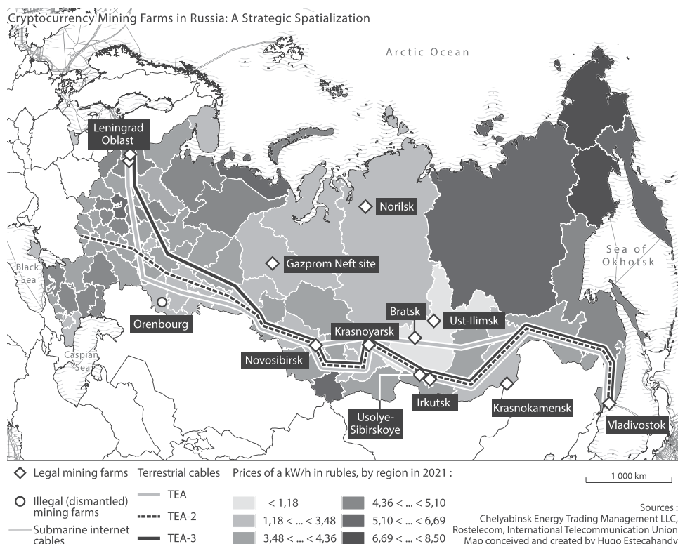
Map 1. Cryptocurrency mining farms in Russia: a strategic spatialization?

it has been struggling to deal with since the disappearance of many industries from the Baikal region after the fall of the USSR.