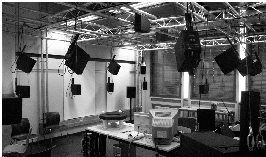
Fig. 4 The smaller 24-channel dome in the studio

Zirkonium's basic conception and development took place from 2003 to 2008, and it is currently being further developed by the ZKM | Karlsruhe in conjunction with the University of Montreal. The goal is to motivate composers, developers, and institutions to get involved in its collective, open source development.