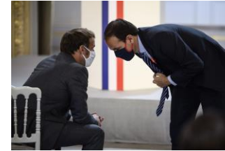
Pdt Emmanuel Macron and Cédric O, State Secretary in charge of digital issues

“a politically and philosophically slippery ground” says someone close to the President.