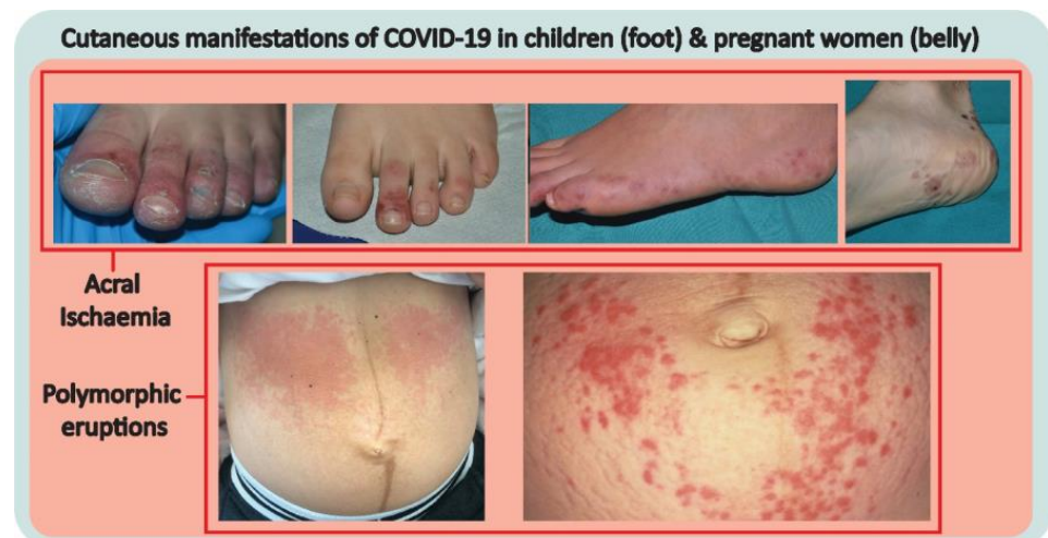
Figure 2. Cutaneous manifestations associated with COVID-19 infection in children (foot) and pregnant women (belly). Adapted with permission from [23,26].

In the pediatric population, if present, the cutaneous symptoms of COVID-19 are often the first signs of infection before fever and cough [22]. These skin manifestations can differ between adults and children [23]. According to the Dr. Lloyd, approximately 15% of children infected with the omicron variant showed rashes on the skin [24]. A significant number of frostbite cases were reported during the first wave in March 2020, especially in children, but also more in adolescents and young adults, especially on the feet. Still, the link with COVID-19 remains to be proven [23]. A study on elderly subjects in France reported that no elderly patient presented skin symptoms such as frostbite or painful, persistent redness [25]. However, most COVID-19 symptoms developed on the skin, including periocular inflammation, ischemia, livedo reticularis and petechiae, and purpura, are more frequently reported in severe cases, compared to other manifestations, including vesiculobullous, ecchymosis, and maculopapular exanthema. During pregnancy, there is a higher risk of complications from COVID-19, and the hormonal and immune changes during this period would also impact the skin manifestations of COVID [26,27]. Such data allude to a link between COVID-19 and its effect on the skin. Figure 2 is illustrating cutaneous manifestations associated with COVID-19 infection in children (foot) and pregnant women (belly).