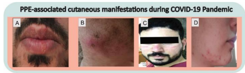
Figure 5. Documented cases of personal protective equipment (PPE) associated skin rashes during the pandemic; (A) Herpes simplex reactivation triggered by friction caused by wearing a surgical mask, (B) gown-related contact urticaria, (C) impressions on the face, (D) mask-related frictional acne. Adapted with permission from [75,86].