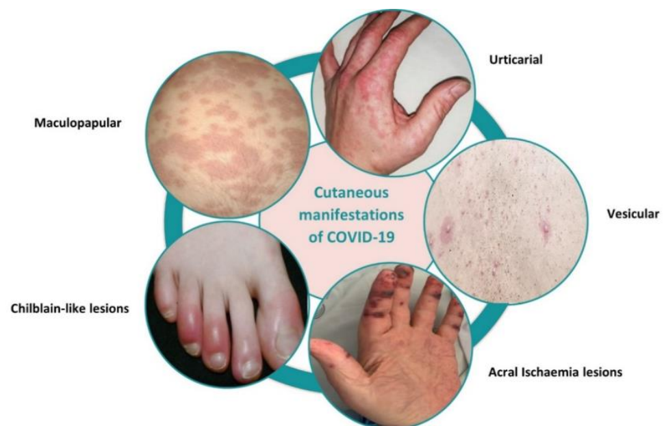
Figure 1. Cutaneous manifestations associated with COVID-19. Adapted with permission from [14,15,18–20].

To confirm this, Cazzato et al. performed a study to investigate the possible association between SARS-CoV-2, ACE2, and skin manifestations. They performed immunohistochemical investigation from nine different skin samples procured from COVID patients. This study presented ambiguous findings in which some authors agreed that clinical manifestations are linked with COVID-19, and some are not linked with COVID-19. However, they provided broad aspects from other literature to get an overview of the impact of COVID-19 on skin manifestations [21].