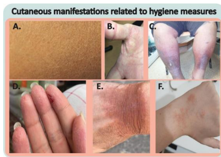
Figure 4. Cutaneous manifestations related to preventative measures implemented for COVID-19 pandemic. Xerosis (A) and irritant contact dermatitis (B) due to frequent handwashing/alcohol-based sanitizers, (C) stasis dermatitis due to sedentary behavior mandates, (D,F) eczematous contact dermatitis, (E) post-inflammatory hyperpigmentation related to severe disinfectant-related dermatitis. Images adapted from [57,75].