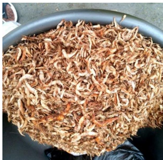
Fig. 1. White shrimp ( N. hastatus )

This study was a cross sectional study conducted between April 2017 and April 2018. A total of 120 white shrimps (Fig. 1) samples were purchased from 2 major market (i.e. Marian market and Watt market) and 2 beaches markets (i.e. Esuk-Nsidung beach market and Obufa Esuk beach market) in Calabar metropolis. Each sample was collected into a sterile polythene bag and sealed to avoid further contamination. All samples obtained were labeled appropriately by indicating the location, time and date of collection. The samples were subsequently conveyed for further evaluation and microbiological analysis. Ten (10 g) of each shrimp sample was homogenized using sterile laboratory mortar. About 1.0 g of the homogenate was mixed with 10 mL of alkaline peptone water and incubated at 37°C for about 6-7 hours. The suspension was serially diluted 10-fold using normal saline, and 0.5 mL of the appropriate dilution was spread over freshly prepared Thiosulfate Citrate Bile-Salt Sucrose (TCBS) Agar plate and MacConkey Agar plate, using a sterile spreader. The plates were incubated at 37°C for 18-24 hours. Following incubation, the plates were observed for characteristic colonies. Discrete representatives of each unique colony type were selected for purification, characterization and identification using conventional microbiological and biochemical tests.