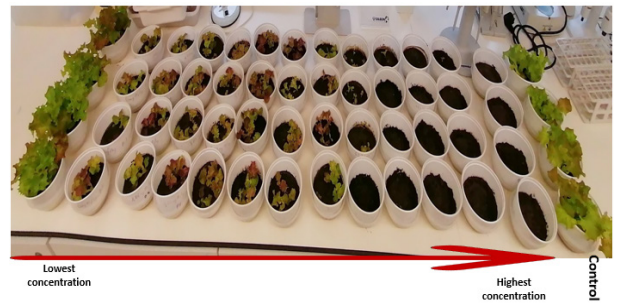
Figure 1 - Phytotoxicity of As to L. sativa .

For the invertebrates, As significantly inhibited the reproduction of E. fetida ( p < 0.01 ) and F. candida ( p < 0.01 ) as the concentration increases, with a total inhibition noted at \geq 93.29 mg As kg^{-1} soil dw as