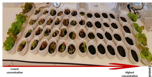
Figure 1 - Phytotoxicity of As to L. sativa .

For the invertebrates, As significantly inhibited the reproduction of E. fetida ( p < 0.01 ) and F. candida ( p < 0.01 ) as the concentration increases, with a total inhibition noted at \geq 93.29 \text{ mg As kg}^{-1} \text{ soil}_{\text{dw}} as