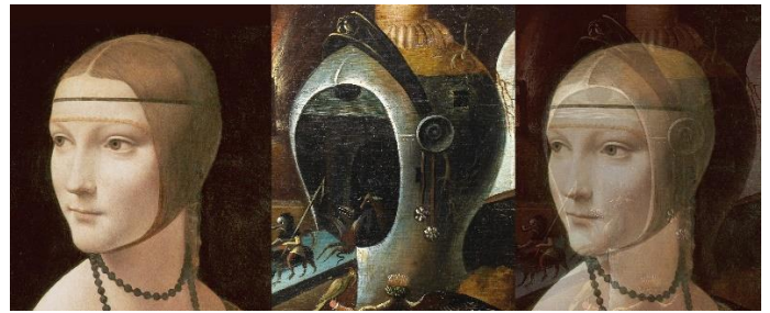
Caterina Sforza, the amazon who fought in armor, sword in hand, against the armies of the all-powerful and fearsome Borgia family!

Caterina Sforza's activity places her at the origins of a Medici interest in alchemy and experimentation that would extend into the 17th century, while positioning her within the broader panorama of modern women's scientific activity. She was not alone in this activity: women's participation in scientific culture was wide and diverse, and the language of recipes proved useful in a variety of contexts, including the Renaissance debate over women. In 1600, Moderata Fonte, in his dialogue, Il Merito delle donne 17 , will pit the efficacy and frankness of certain medicinal and cosmetic recipes – capable of curing disease or transforming appearance – against the impossible task of finding a recipe for teaching men to respect women as their equals 18 .