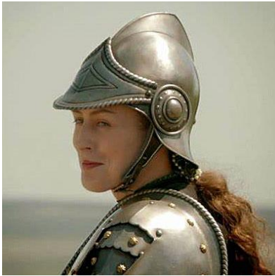
Caterina Sforza played on screen by Gina McKee 11

1488 by supporters of the new pope, Innocent VIII 10 , she was led to exercise the regency in the name of her son Ottaviano, still a minor. As a perfect strategist trained in the executive, she begins by lowering taxes and sealing alliances with neighboring states through the unions contracted for her sons. Moreover, driven by her natural inclination for the army, as an authentic condottiere, she takes charge of the military training of her troops.