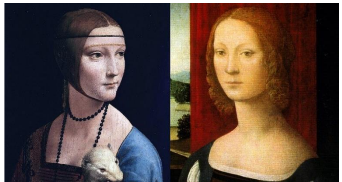
The Lady with an Ermine is... Caterina Sforza ?

In 1495, the King of France, Louis XII, allied with Pope Alexander VI 13 - who succeeded three years earlier to Innocent VIII - decides to declare war on the Italian States. He first conquered the Duchy of Milan while the Pope claimed the domains of Romagna for Cesare Borgia, "the Valentino" his son. What the indomitable Caterina Sforza is obviously not willing to accept. Caterina Sforza immediately set to work to expand her troops, improve the armament and store large quantities of provisions and ammunition in anticipation of a possible siege led by the troops commanded by César Borgia, Duke of Valentinois and son of the Pope. It also strengthens the defenses of its fortresses, in particular that of Ravaldino, where it resides.