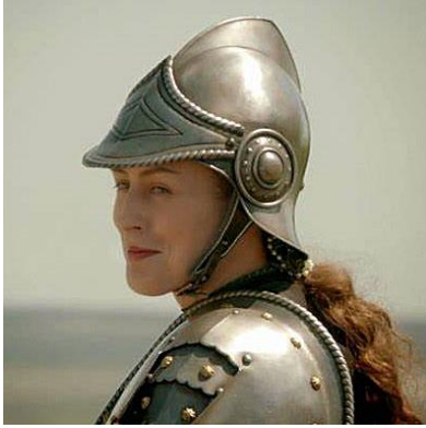
Caterina Sforza played on screen by Gina McKee 11

1488 by supporters of the new pope, Innocent VIII 10 , she was led to exercise the regency in the name of her son Ottaviano, still a minor. As a perfect strategist trained in the executive, she begins by lowering taxes and sealing alliances with neighboring states through the unions contracted for her sons. Moreover, driven by her natural inclination for the army, as an authentic condottiere, she takes charge of the military training of her troops.