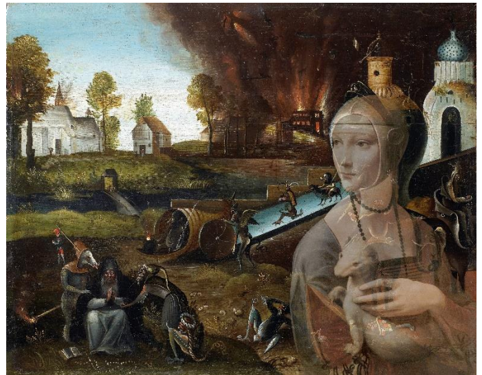
Superposition and transparency of the Lady with an Ermine and the Great Work of Leonardo 19