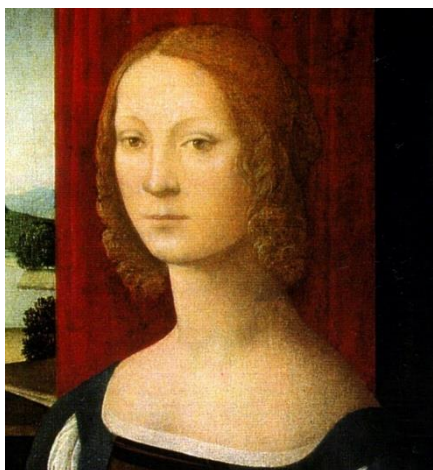
Portrait of Caterina Sforza by Lorenzo di Credi

Xavier d'Hérouville 1 & Aurore Caulier 2