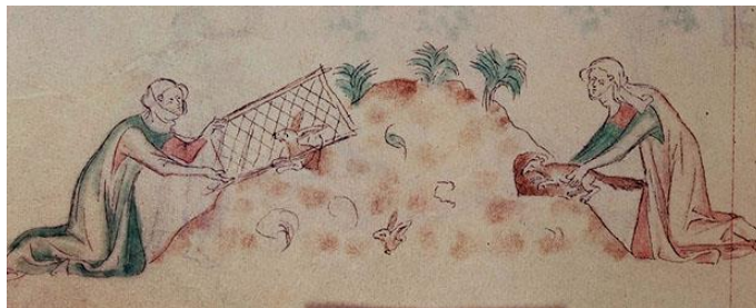
Women ferreting rabbit hunts in the Queen Mary Psalter 7

Caterina Sforza was raised by her paternal grandmother Bianca Maria Visconti in the lively and refined court of the great poets and writers of the Italian Renaissance. The latter, as well as her father, transmitted to her their passion for war and hunting and taught her the art of governing 6 .