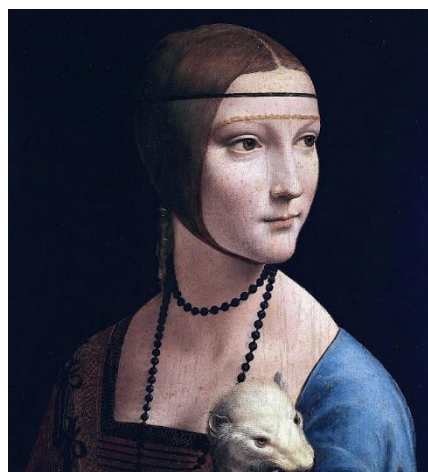
The Lady with an Ermine by Leonardo da Vinci

This "ermine" - which is actually an albino ferret - is an early example of a pet ferret, whose conspicuous coat was particularly prized for rabbit hunting 8