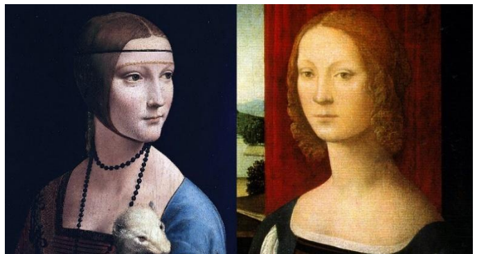
The Lady with an Ermine is... Caterina Sforza ?

In 1495, the King of France, Louis XII, allied with Pope Alexander VI 13 - who succeeded three years earlier to Innocent VIII - decides to declare war on the Italian States. He first conquered the Duchy of Milan while the Pope claimed the domains of Romagna for Cesare Borgia, "the Valentino" his son. What the indomitable Caterina Sforza is obviously not willing to accept. Caterina Sforza immediately set to work to expand her troops, improve the armament and store large quantities of provisions and ammunition in anticipation of a possible siege led by the troops commanded by César Borgia, Duke of Valentinois and son of the Pope. It also strengthens the defenses of its fortresses, in particular that of Ravaldino, where it resides.