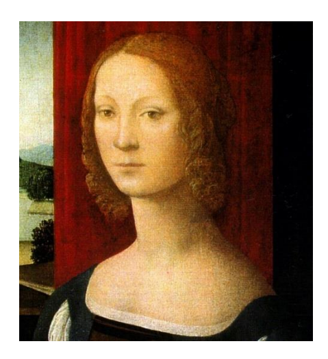
Portrait of Caterina Sforza by Lorenzo di Credi

Xavier d'Hérouville 1 & Aurore Caulier 2