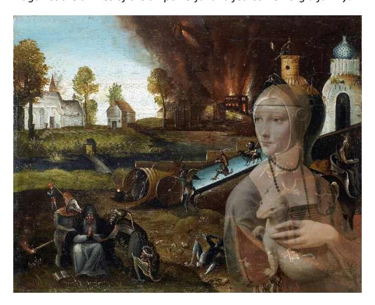
Superposition and transparency of the Lady with an Ermine and the Great Work of Leonardo 19

The esoteric science revealed by this painting is of such depth that one wonders where and how a man, at the end of the Middle Ages, was