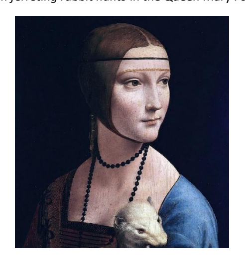
The Lady with an Ermine by Leonardo da Vinci

This "ermine" - which is actually an albino ferret - is an early example of a pet ferret, whose conspicuous coat was particularly prized for rabbit hunting <sup>8</sup>