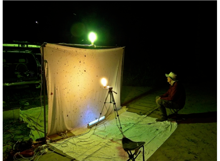
Fig. 7. Method of collecting the holotype of Rismethus rainoni n. sp.

And finally, we would also like to thank the people who contributed to the realization of the expeditions: Lionel Delaunay and Pascal Deschamps.