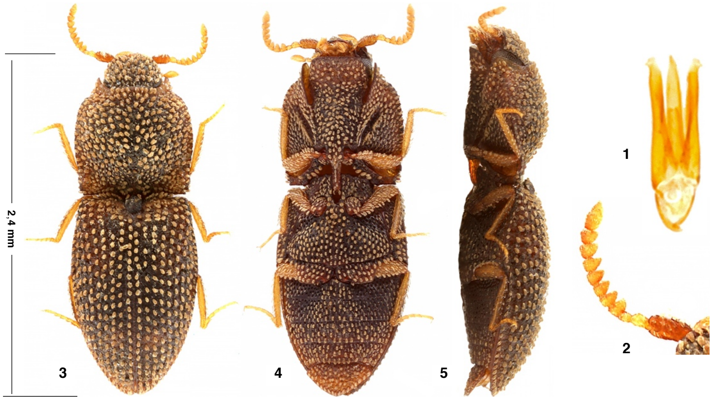
Fig. 1-5. Rismethus rainoni n. sp.

1. Aedeagus, dorsal view. 2. Antenna. 3-5. Habitus. 3. Dorsal. 4. Ventral. 5. Lateral.