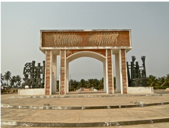
Illustration de la couverture :

Giuseppe Platia & Alain Coache ..... 1 – 4