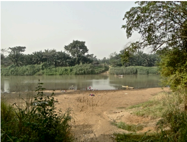
Fig. 6. Biotop of the holotype of Rismethus rainoni n. sp.

1. Aedeagus, dorsal view. 2. Antenna. 3-5. Habitus. 3. Dorsal. 4. Ventral. 5. Lateral.