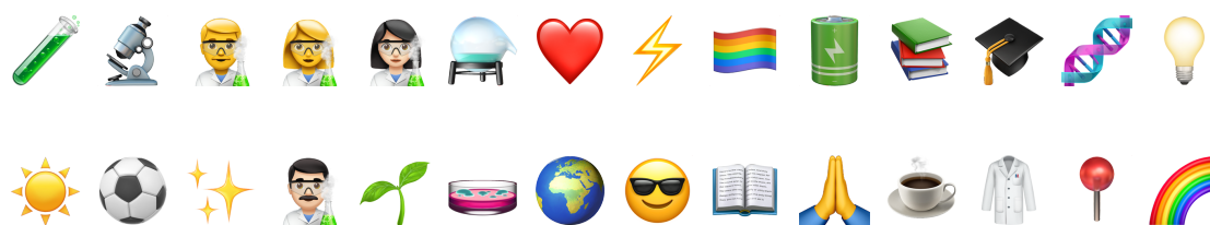
Figure 4. Most frequent emojis in followers’ profiles. National flags were excluded from the analysis.

Finally, Figure 4 shows the 24 most frequent emojis featured in user profiles (once national flags have been excluded). We find a lot of different symbols related to chemistry (test tube, microscope, alembic, both men and women figures wearing a lab coat) used by people to show their professional occupation, but we also find some more specific emojis related to subfields: high voltage and battery emojis are commonly used to indicate energy materials and batteries; DNA helix and Petri dish for biology; sun for solar energy and related materials; seedling and earth emoji are commonly used for environmental sciences; etc. We note that the most common emojis not science- or academic-related are quite universal: rainbow and rainbow flag, football, books, and coffee.