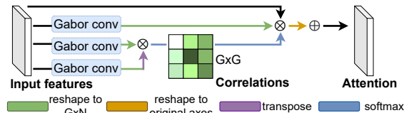
Fig. 3: Proposed Gabor attention operator. G is number of modulating Gabor filters, N is the product of other axes. \otimes denotes matrix multiplication, and \oplus element-wise addition.

the use of both while introducing a multi-scale analysis.