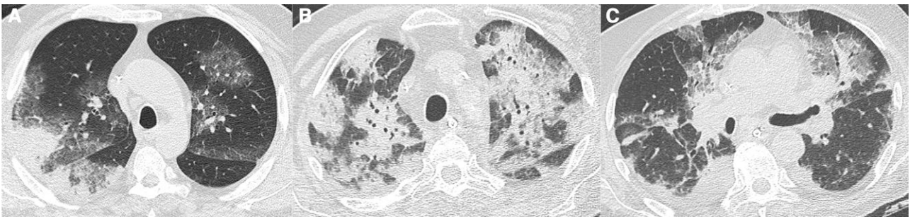
Figure 1. Different computed tomography (CT) patterns of daptomycin-induced eosinophilic pneumonia, with specific signs on CT scan based on criteria by Jeong et al [15]. A, Diffuse ground glass opacities and air-space consolidations compatible with chronic eosinophilic pneumonia. B and C, Same patient with multiple bilateral infiltrates compatible with chronic eosinophilic pneumonia (B) and central ground glass opacities with interlobular septal lines suggestive of acute eosinophilic pneumonia (C).