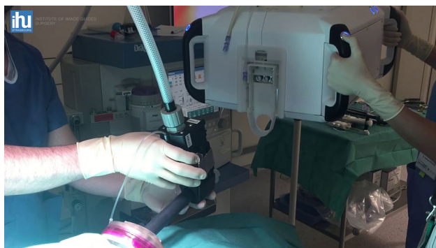
Fig. 2 Docking procedure: the CIT is introduced through the gel access port and connected to the CU

ments via the CIT. C Surgeon position at the workstation. D The open surgeon workstation design allows direct interaction in the operating theatre