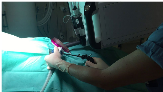
Fig. 3 Assistant introducing a standard laparoscopic instrument through an additional assistant port. The port distance to the CIT and CU allows for a large motion range

The modified OSATS Score (Table 1) allowed to objectively evaluate each surgeon's performance. The two observers' scores showed congruence, thereby validating the choice