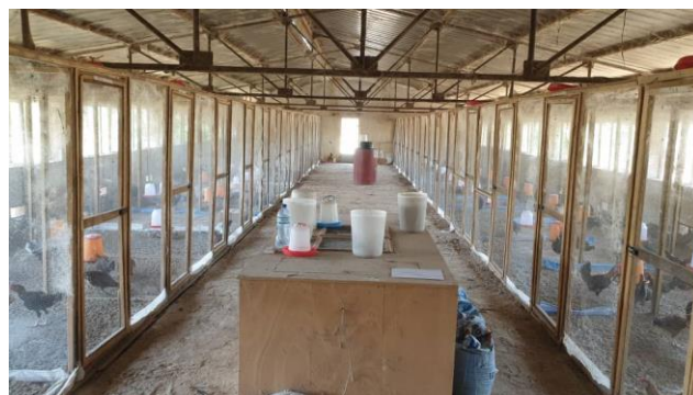
Figure 1. The Interior of the breeding building shows the distribution of the chickens in the cages, with 10 chickens per cage

were reared under natural lighting, and the ambient temperature and humidity of the building were not manipulated. They were recorded daily with a thermo-hygrometer indicating daily maximum and minimum temperatures. The chickens were weighed weekly using a digital dial scale with a precision of one gram. All animals were vaccinated against the two main avian diseases of Newcastle and Gumboro endemic in Niger. Table 2 shows the vaccination protocol that was followed in the current study.