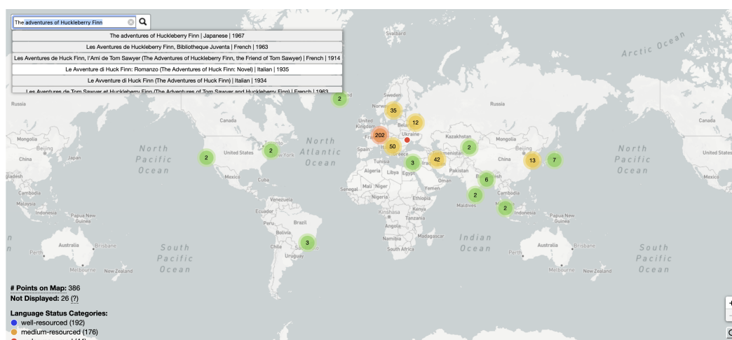
Figure 1: The global knowledge Map representing existing translations and bibliographic records of Adventures of Huckleberry Finn worldwide.

Unlike existing knowledge sharing models used by most digital libraries and collections, we propose a new interactive model allowing end-users and volunteer scholars to search, contribute and share their knowledge about an original work through an interactive and online global knowledge map (Figure 1) called Deep Maps in [21].