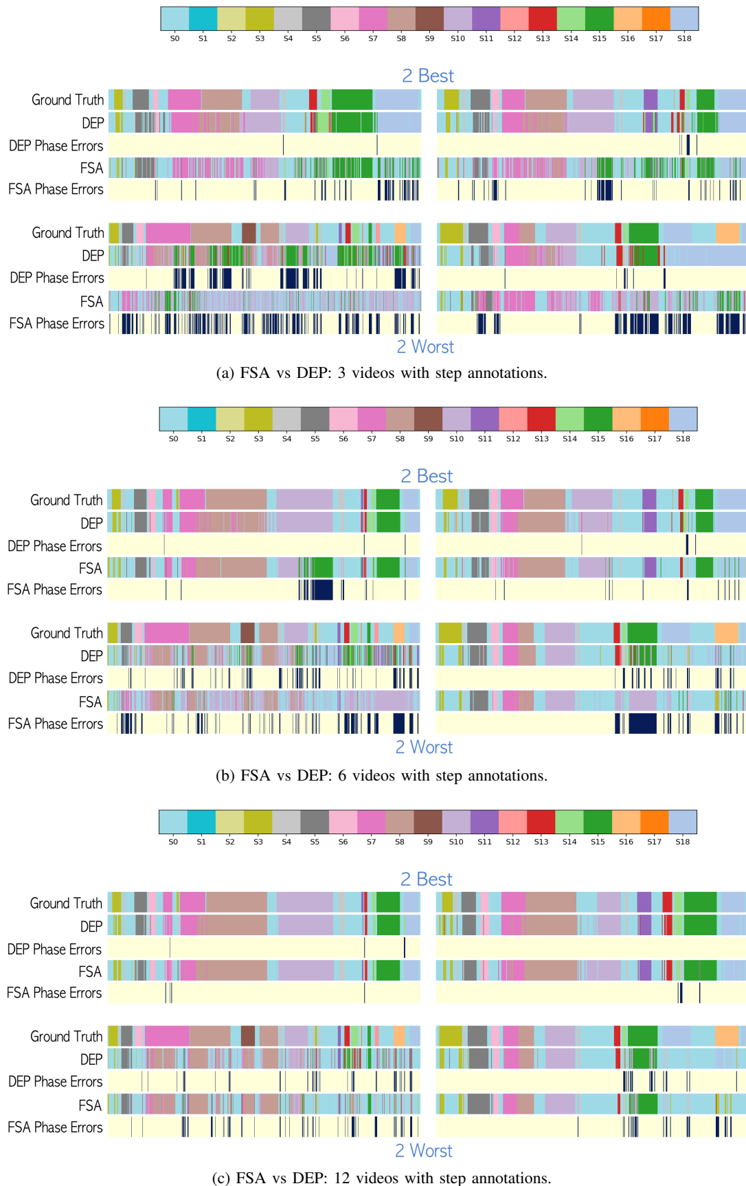
Fig. 3: Step predictions on two best and two worst videos on the CATARACTS dataset for different labeled ratios. For each video, we visualize the step prediction of ground truth, DEP model predictions, DEP model phase prediction errors, FSA model predictions, and phase prediction errors of FSA model.