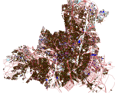
Fig. 1: Dijon metropolitan area with 250,000 inhabitants