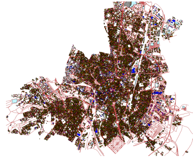
Fig. 1: Dijon metropolitan area with 250,000 inhabitants