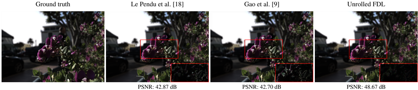
Fig. 2: Refocused images for the scene Orchids from the Kalantari dataset [28] using 2-shots, with the different methods. A portion of the error map, amplified with a factor of 10, is highlighted.