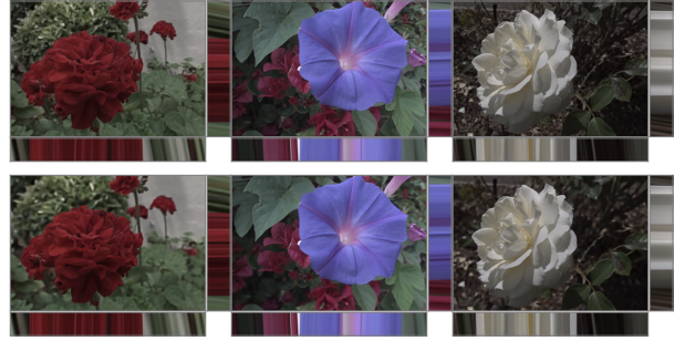
Fig. 3: Central views along with EPIs for 3 LFs in the Flowers dataset [14]. Top row are the LFs produced by the joint model with rank r = 16384 ; bottom row corresponds to a model specifically fitted for one LF.