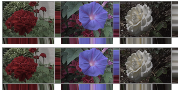
Fig. 3: Central views along with EPIs for 3 LFs in the Flowers dataset [14]. Top row are the LFs produced by the joint model with rank r = 16384 ; bottom row corresponds to a model specifically fitted for one LF.