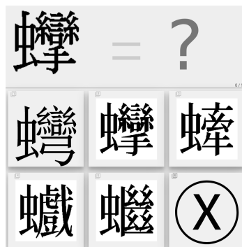
Figure 2: screenshot of the crowdsourcing interface. A simple click or tap on the match will take the user to another character