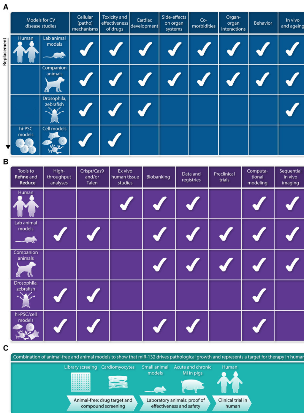
Figure 1 (A) Models that are available for studies on cardiovascular disease, ranging from human and laboratory animals to stem cell-derived models. Aspects that can be measured currently in the different models are indicated with the white check mark. This overview shows that several models allow to reduce the number of studies in laboratory animals, as many initial steps in identification of pathomechanisms, testing drug toxicity and drug effectiveness can be studied in cell-based models. Clearly, studies in human itself offers multiple opportunities to reduce the work in laboratory animals. (B) Multiple tools have been developed in past years to refine and replace studies in the models used for cardiovascular research, and range from tools and expertise to characterize human tissue samples obtained during surgery to models derived from hiPSCs (human induced pluripotent stem cells). (C) Example of an experimental design making use of available complementary research models based on the 3R principles. 2

pathways triggered by the initial cardiac injury. This includes CM remodelling and alteration of metabolism, followed by progressive LV dilatation (eccentric remodelling), associated with extensive remodelling of the