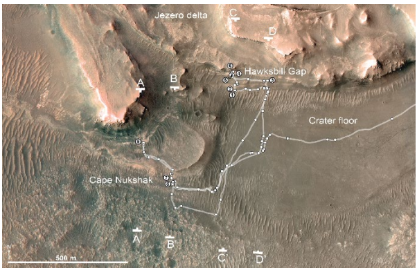
Fig. 1. Map of the Jezero western delta front showing the locations of Perseverance's traverse, Hawksbill Gap and Cape Nukshak

Introduction: The NASA Mars2020 rover Perseverance has been traversing series that represent the transition from crater floor lithologies to deposits of the Jezero western delta since Sol 422 of rover operations [1]. During that time, the mission has explored the exposed stratigraphic succession at the delta front, named the Shenandoah formation [2]. Here we analyse Mastcam-Z mosaics and 3D data products derived from Planetary Robotics processing and viewing tools (PRoViP and PRo3D [3]) to map the 3D geometry of key stratigraphic boundaries and document the 3D stratigraphic architecture at the sub-km- to m-scale within the Shenandoah formation.