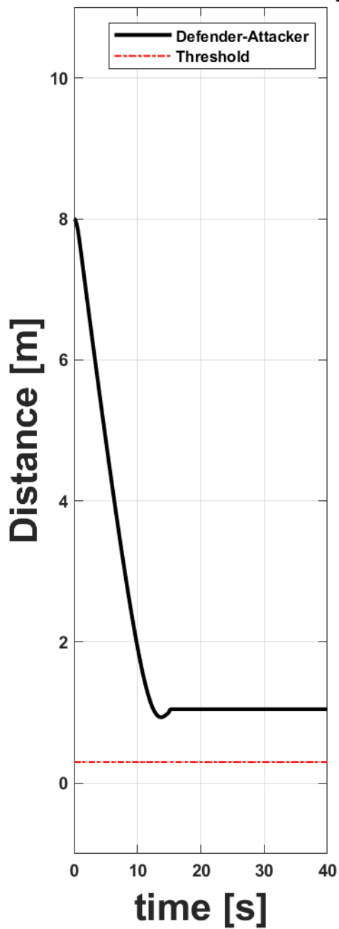
Game Termination Condition ( C_2 )