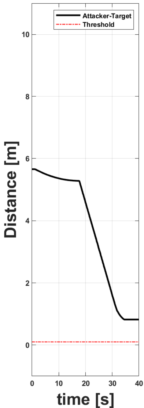
Game Termination Condition ( C_1 )