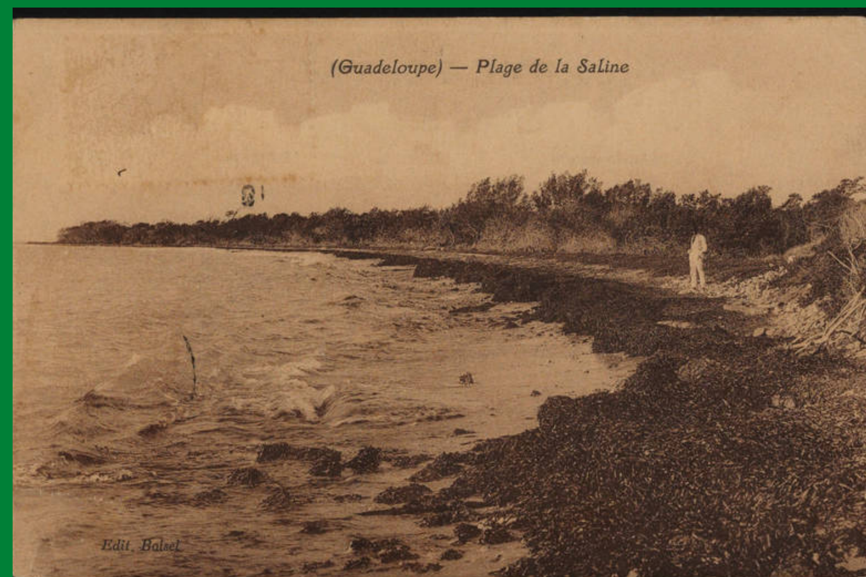
PHOTO 1 : POSTCARD OF THE SALINES BEACH DATED FROM THE BEGGINING OF THE 20TH CENTURY