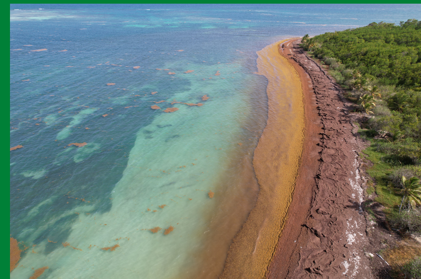
PHOTO 2 : AERIAL VIEW BY DRONE OF THE SALINES BEACH ON AUGUST 11TH 2021

Seaweed on the coasts of Guadeloupe seemed to be present already at the beginning of the century (Photo 1), but since 2011, Guadeloupe has experienced a massive arrival of Sargassum seaweed (Photo 2). The response to these recent arrivals has been the systematic collection of seaweed on the beaches of Gosier until 2017. Empirically, the municipality noted a retreat of the coastline until 2017 but, since the cessation of collection, it has noted an advance of about ten meters of the coastline on the beaches of Salines, a sandy beach with a longitudinal profile exposed to a predominantly easterly swell, and Anse Dumont, a beach exposed to the southeast. Experiments have shown a link between Sargassum stranding and coastal erosion control (Innocenti et al., 2018; Roano et al., 2022). The Geomatik Karaïb consultancy in partnership with students of the Master Diagnostic Territorial et Gestion des Espaces Insulaires (University of the West Indies) propose to study the phenomenon.