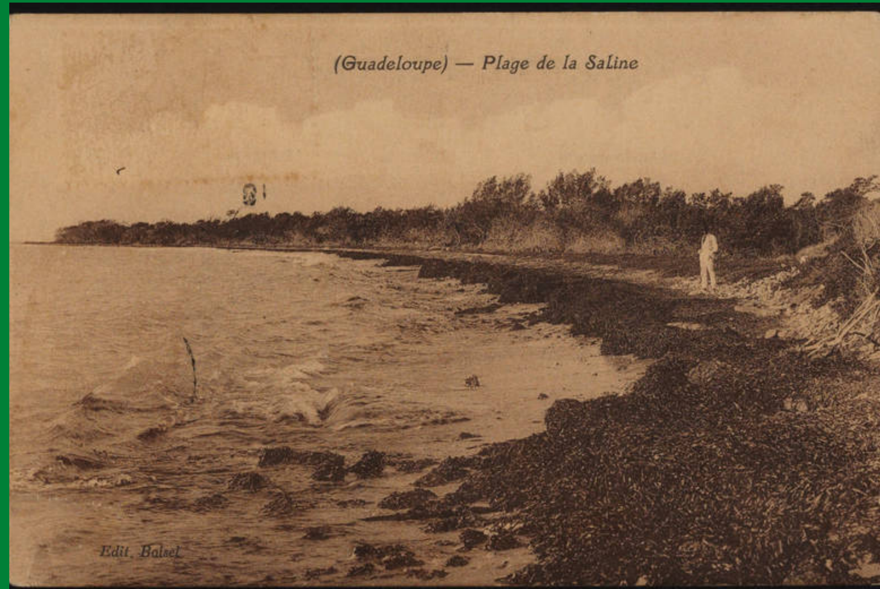
PHOTO 1 : POSTCARD OF THE SALINES BEACH DATED FROM THE BEGGINING OF THE 20TH CENTURY

* Géomatik Karaïb and Drone Karaïb, El Murielle Angélique MANTRAN, contact@geomatik-karaib.fr ** SASU Antilles drone