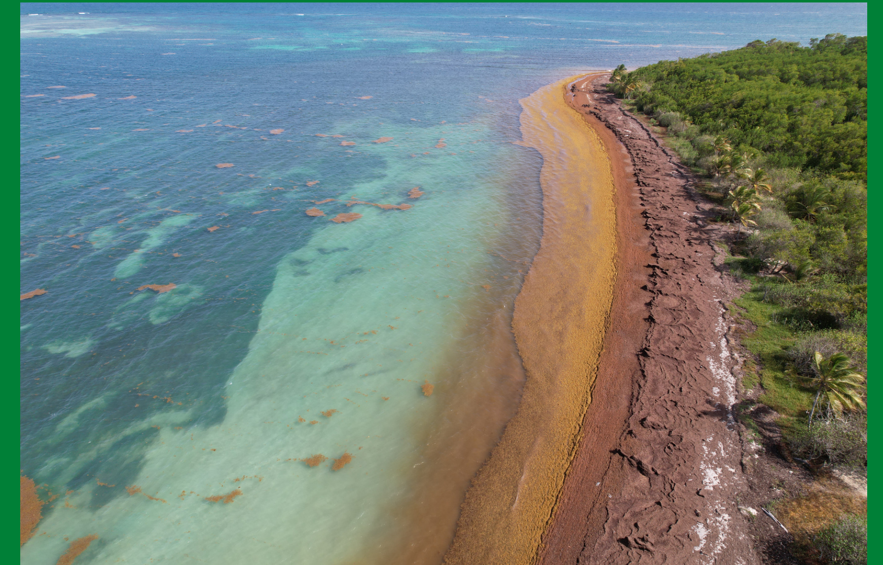
PHOTO 2 : AERIAL VIEW BY DRONE OF THE SALINES BEACH ON AUGUST 11TH 2021

Seaweed on the coasts of Guadeloupe seemed to be present already at the beginning of the century (Photo 1), but since 2011, Guadeloupe has experienced a massive arrival of Sargassum seaweed (Photo 2). The response to these recent arrivals has been the systematic collection of seaweed on the beaches of Gosier until 2017. Empirically, the municipality noted a retreat of the coastline until 2017 but, since the cessation of collection, it has noted an advance of about ten meters of the coastline on the beaches of Salines, a sandy beach with a longitudinal profile exposed to a predominantly easterly swell, and Anse Dumont, a beach exposed to the southeast. Experiments have shown a link between Sargassum stranding and coastal erosion control (Innocenti et al., 2018; Roano et al., 2022). The Geomatik Karaïb consultancy in partnership with students of the Master Diagnostic Territorial et Gestion des Espaces Insulaires (University of the West Indies) propose to study the phenomenon.