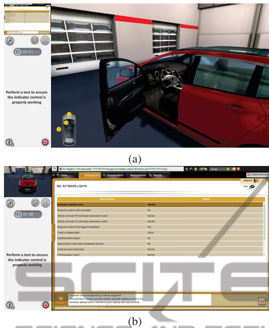
Figure 1: The game environment of Diag'Adventures features two views : (a) the interactive car in 3D and (b) the diagnostic software.

which should allow for a less steep learning curve and a more efficient transfer into the real world of the knowledge acquired virtually, since it eases the back and forth transitions between the game and the real-life activities. In the next section, we will briefly review the related work. Then, we will point out the coexistence of two separate dimensions within a scenario: the description of the activity and the pedagogy. This will lead us to propose a model, which we will detail and illustrate with the aforementioned scenario. We conclude that our approach empowers the trainers with the necessary tools to describe their professional and pedagogical expertise in an expressive yet formal fashion.