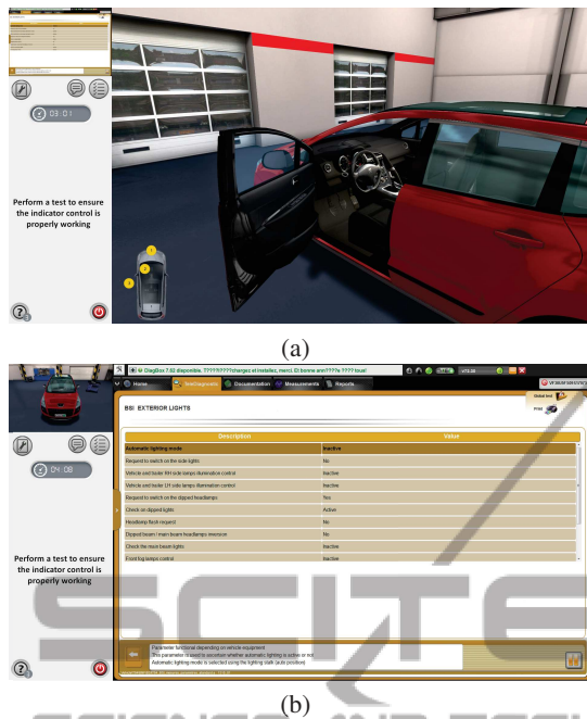
Figure 1: The game environment of Diag'Adventures features two views : (a) the interactive car in 3D and (b) the diagnostic software.

which should allow for a less steep learning curve and a more efficient transfer into the real world of the knowledge acquired virtually, since it eases the back and forth transitions between the game and the real-life activities. In the next section, we will briefly review the related work. Then, we will point out the coexistence of two separate dimensions within a scenario: the description of the activity and the pedagogy. This will lead us to propose a model, which we will detail and illustrate with the aforementioned scenario. We conclude that our approach empowers the trainers with the necessary tools to describe their professional and pedagogical expertise in an expressive yet formal fashion.