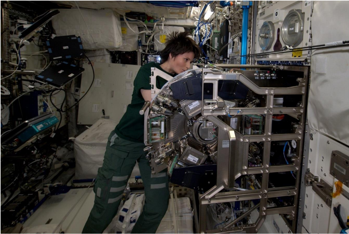
Fig. 2. ESA astronaut Samantha Cristoforetti working with ESA's Biolab facility in the Columbus laboratory on the International Space Station.

produced a document of recommendations for Biolab to be capable of harboring experiments using crop species and encompassing the full plant life cycle. Whatever the final decision adopted, the need of an effective plant cultivation facility in Space with the capabilities mentioned above, as a key to support the human life in space exploration, is becoming more and more urgent within the next years.