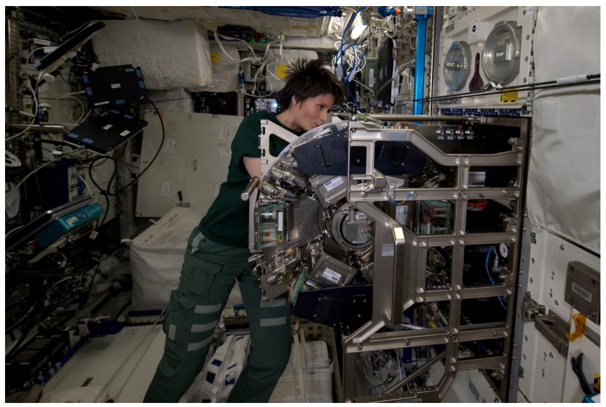
Fig. 2. ESA astronaut Samantha Cristoforetti working with ESA's Biolab facility in the Columbus laboratory on the International Space Station.

produced a document of recommendations for Biolab to be capable of harboring experiments using crop species and encompassing the full plant life cycle. Whatever the final decision adopted, the need of an effective plant cultivation facility in Space with the capabilities mentioned above, as a key to support the human life in space exploration, is becoming more and more urgent within the next years.