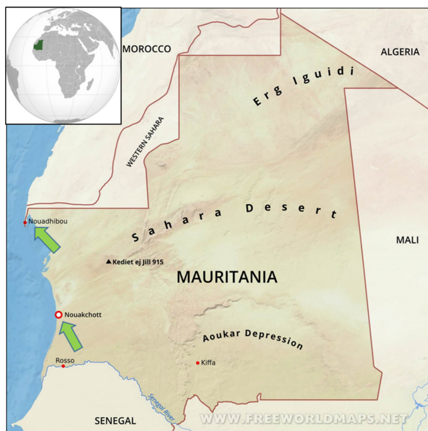
Figure 1. Representation of Mauritania, West Africa. The two localities in which the bed bugs were collected in domestic settings, between September 2021 and October 2021, are indicated with green arrows (from North to South: Nouadhibou and Nouakchott).