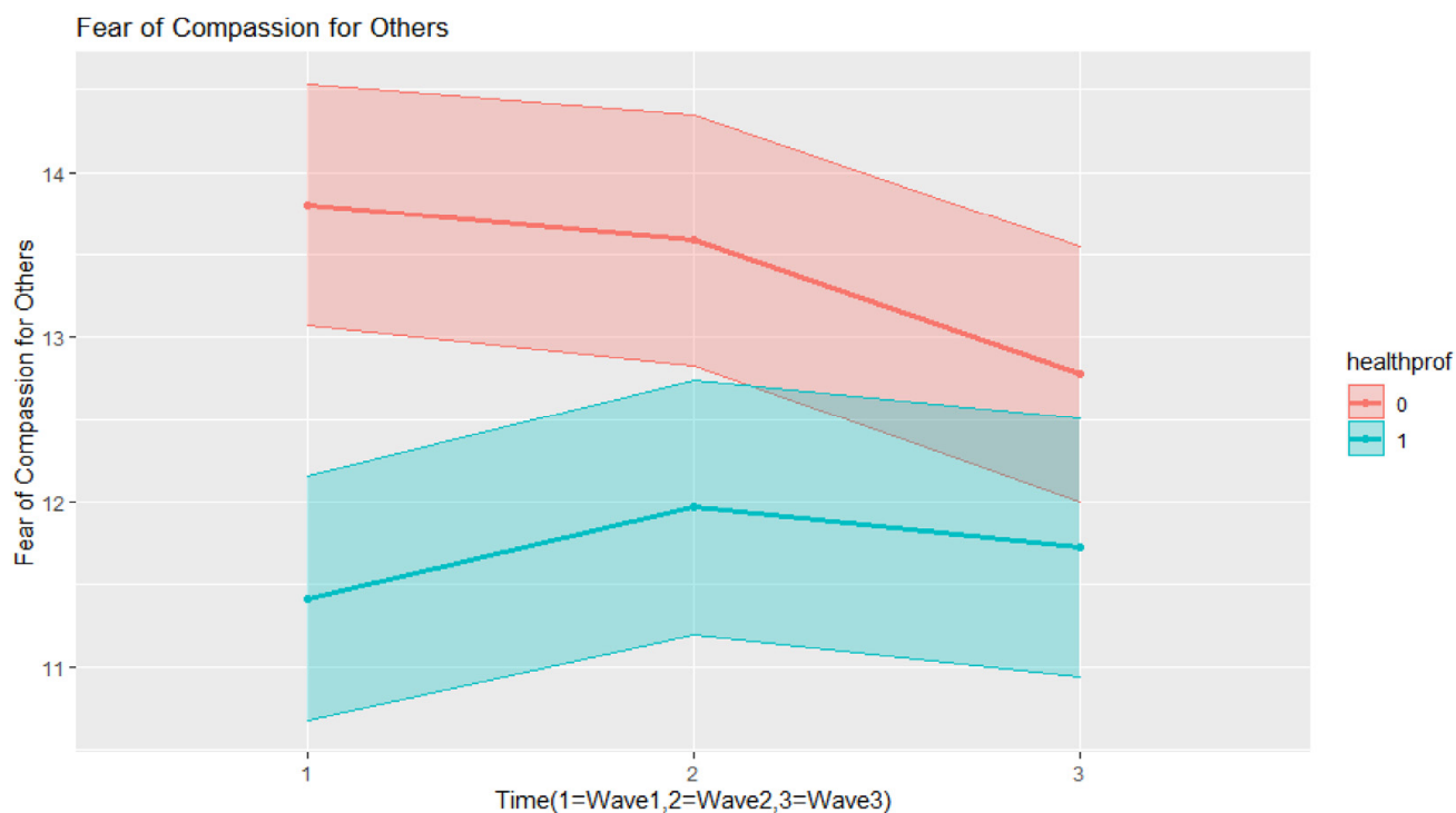
Figure 2. Interaction effects in the final model for fears of compassion for others.