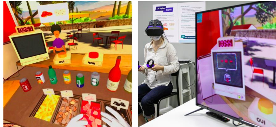
Figure 3: Screenshot of Back to pizza (left) and real set up

All the orders are chosen before the game by the public which follows the realization through an external screen (Cf. Figure 3 ). The player orders pizzas in a time limit of 3 minutes. The countdown is visible to the player in the game environment (Cf. Figure 3 ).