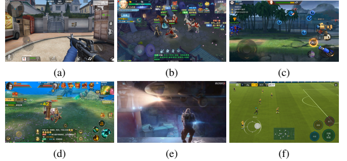
Fig. 1. Thumbnails of selected mobile gaming contents.

variety of different setting/configurations, e.g., CRF values were selected randomly from [1, ..., 50].