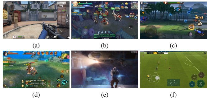
Fig. 1. Thumbnails of selected mobile gaming contents.

variety of different setting/configurations, e.g. , CRF values were selected randomly from [1, ..., 50].