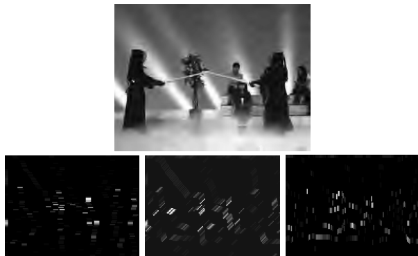
Fig. 4. Image Kendo synthesized from the content with JPEG2000 distortion (top); DoC bands at resolution level 4 and scale 5 created using line-shaped structuring elements in three directions: horizontal (bottom left), 45 degrees (bottom middle), vertical (bottom right).

The DoC bands at resolution level 4 and scale 5, created using line-shaped structuring elements in three directions 0, 45, 90 degrees from the image Kendo synthesized from the content with JPEG2000 distortion are shown on Fig. 4. The oriented lines extracted in DoC bands correspond to perceptually important building blocks of object structures.