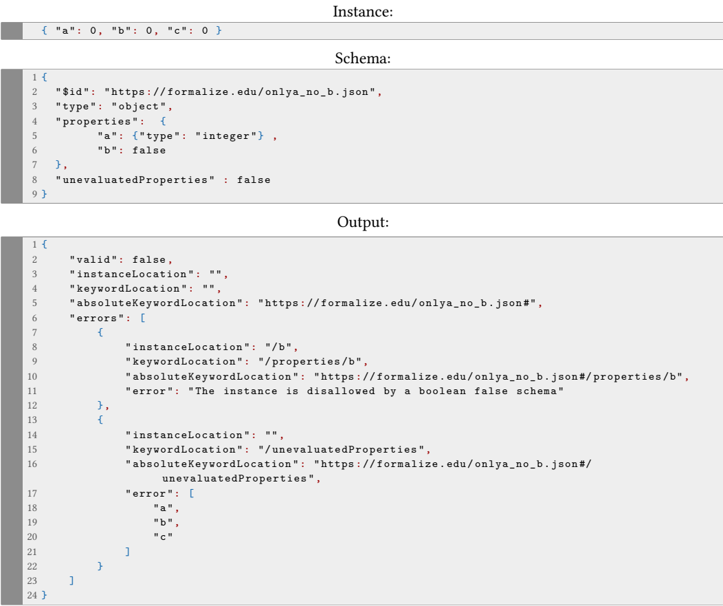
Fig. 12. Annotations returned by jschon.dev, example 1.