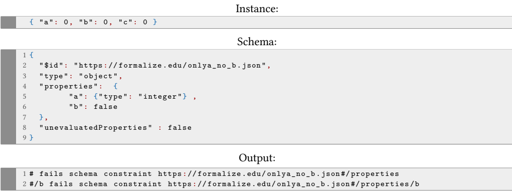
Fig. 13. Annotations returned by Hyperjump, example 1.