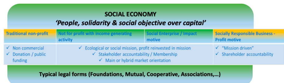
Figure 1: The Social Economy Spectrum, Derived from Alter (2004) and Crossan (2005)

Our analysis is part of the construction of an international recognition of the SSE as an actor of economic, social, and environmental development. It relies on the various reports published by the ILO in the last 20 years that refer to the SSE, cooperatives, non-profit organizations, and social enterprises [10,37,38] (see Figure 1). All of these types of organizations are commonly defined by the societal value placed at the center of their business model and principles and by their positive impact on society [10]. Internationally, social enterprises are sometimes defined as non-profit organizations selling at least one product or service in the marketplace [37]. Social cooperatives are usually considered a significative form of social enterprise. Historically, cooperatives have been dominant in ILO reports. More recently, we have observed, however, a broadening of the organizational forms taken into consideration.