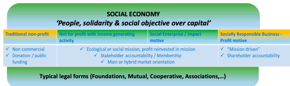
Figure 1: The Social Economy Spectrum, Derived from Alter (2004) and Crossan (2005)

Our analysis is part of the construction of an international recognition of the SSE as an actor of economic, social, and environmental development. It relies on the various reports published by the ILO in the last 20 years that refer to the SSE, cooperatives, non-profit organizations, and social enterprises [10,37,38] (see Figure 1). All of these types of organizations are commonly defined by the societal value placed at the center of their business model and principles and by their positive impact on society [10]. Internationally, social enterprises are sometimes defined as non-profit organizations selling at least one product or service in the marketplace [37]. Social cooperatives are usually considered a significant form of social enterprise. Historically, cooperatives have been dominant in ILO reports. More recently, we have observed, however, a broadening of the organizational forms taken into consideration.