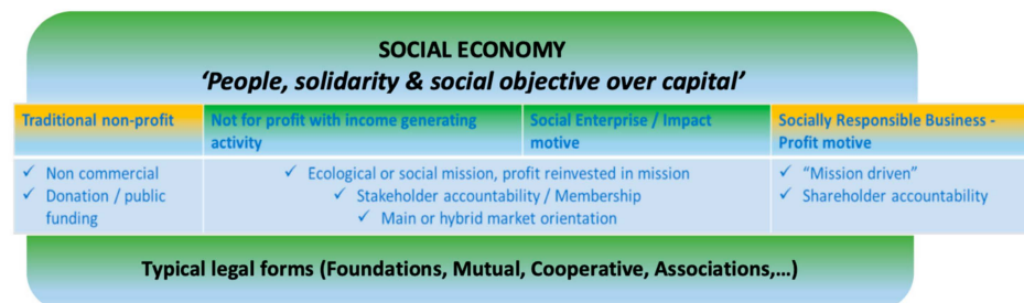
Figure 1: The Social Economy Spectrum, Derived from Alter (2004) and Crossan (2005)

Our analysis is part of the construction of an international recognition of the SSE as an actor of economic, social, and environmental development. It relies on the various reports published by the ILO in the last 20 years that refer to the SSE, cooperatives, non-profit organizations, and social enterprises [10,37,38] (see Figure 1). All of these types of organizations are commonly defined by the societal value placed at the center of their business model and principles and by their positive impact on society [10]. Internationally, social enterprises are sometimes defined as non-profit organizations selling at least one product or service in the marketplace [37]. Social cooperatives are usually considered a significant form of social enterprise. Historically, cooperatives have been dominant in ILO reports. More recently, we have observed, however, a broadening of the organizational forms taken into consideration.