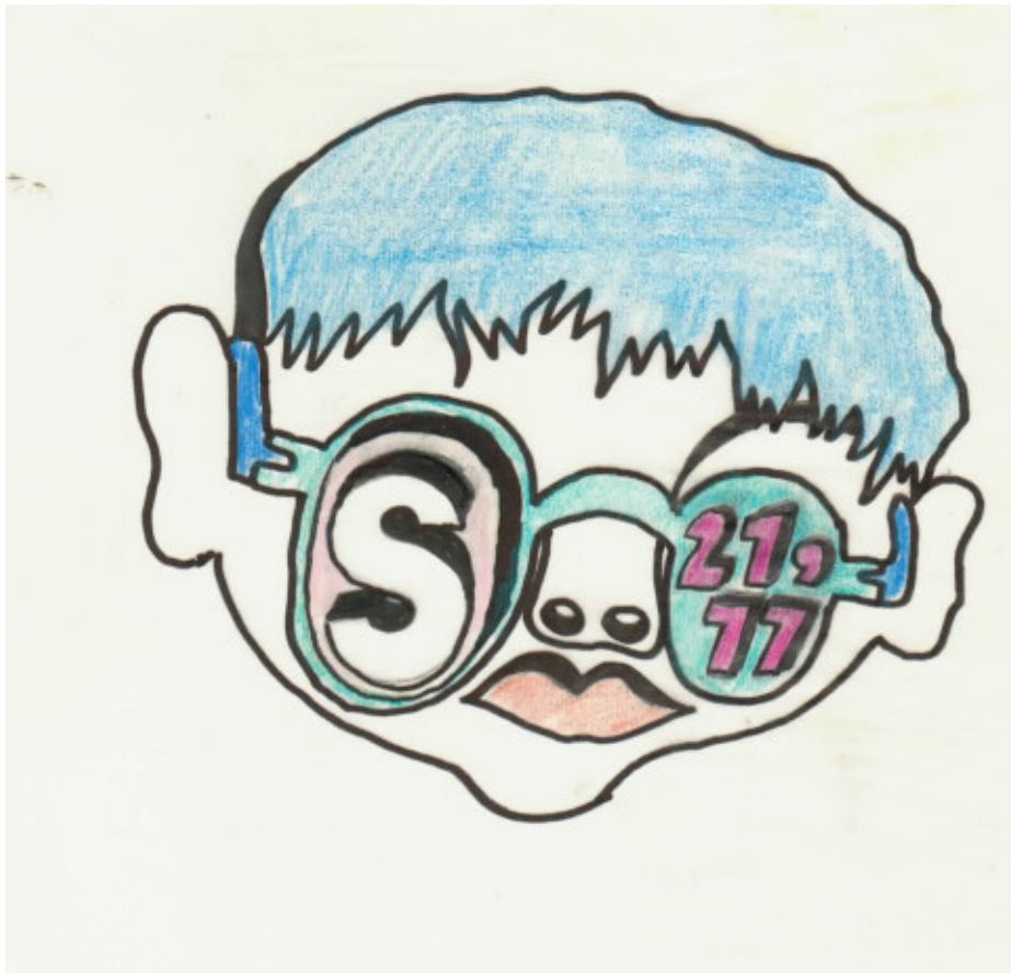
Figure 2 - Homo obædiens . Geppert, Zbigniew.1969. Crayon on paper. Collection of the Geppert Family, Reims, France.