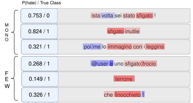
(b) Samples in Italian