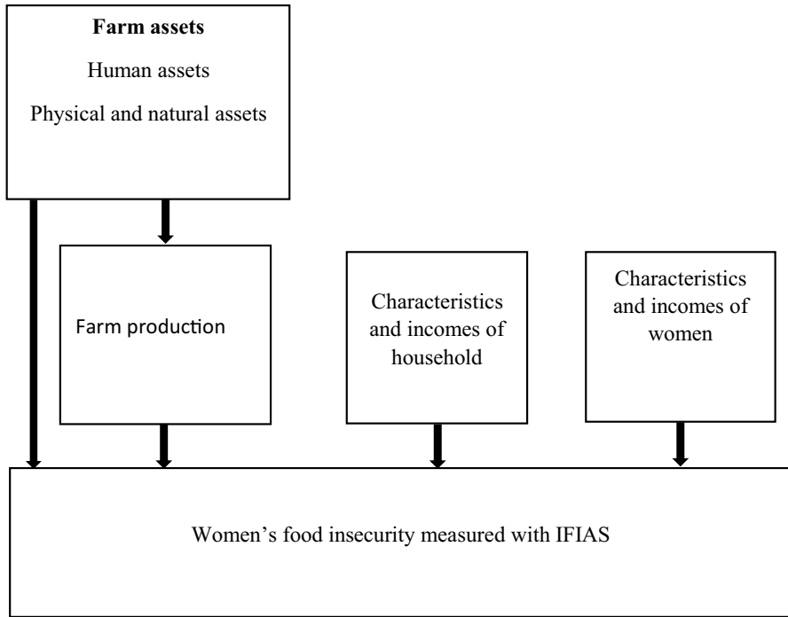
Fig. 1 Relation between farm assets, household and individual characteristics and women's food security

the production level and not linked to consumption. The instrumental variables should only impact consumption through their effect on production.