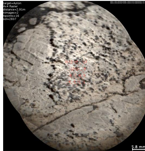
Fig. 1. Image from ChemCam target Ayton (sol 2837) depicting LIBS targets that hit nodules containing high Mn with adsorbed P.

By studying adsorption processes in the context of the observations made by Curiosity in Gale crater, it will be possible to better characterize P on Mars and improve our understanding of how phosphorus was mobilized to these locations.