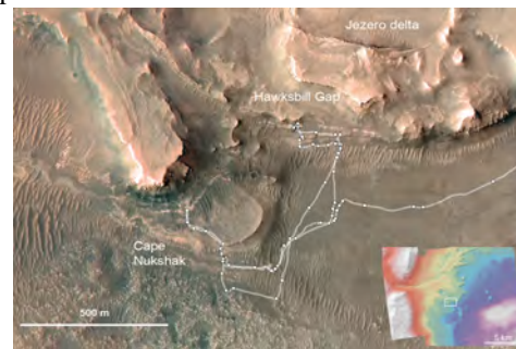
Fig. 1 Map of the Hawksbill Gap and Cape Nukshak in the Three Forks region.

Here, we report its stratigraphy and sedimentology, which provide new constraints on the nature of the fan deposits, and therefore paleoenvironmental implications.