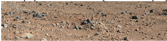
Fig. 1 Sol 431 pyramidal ventifacts (aka wheel destroyers) on Bradbury Fm. Mastcam sol 431 ML_001752.

Introduction: The topography traversed by the Mars Science Laboratory (MSL) Curiosity rover for ten years ranges from the swales and troughs of the Bradbury Formation ( Fig. 1 ), up through the spectacular valleys and hills of the Marker Band valley on the lower slopes of Mt. Sharp ( Fig. 2 ). The terrain along the traverse consists of fluvial, lacustrine, and aeolian sedimentary rocks. The nature of this terrain is very different from our tantalizing views of the Gale crater rim across the crater floor, presumed to consist of igneous crustal rocks. The observations from Curiosity lead to the question of the primary erosion mechanism and rates of erosion in different areas along the Curiosity traverse [1, 2]. Multiple lines of evidence support the role of topographic focusing of sand, and thus aeolian erosion by saltation abrasion along swales and valley floors. This process was postulated by the late Nathan Bridges [3] during the early stages of Curiosity's journey, and there is now more evidence for this hypothesis. Also, aeolian erosion is likely more effective during periods with a denser atmosphere due to obliquity variations as recently as 0.5 - 5 Ma [4-6].