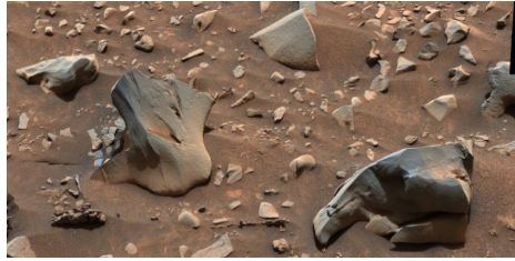
Fig. 4. Ventifacts along the edge of a spur valley from Gediz Vallis,

valleys from the main traverse in the Gediz Vallis region (Fig. 4). However, there is not a continuum of fresh uneroded blocks grading into increasingly more eroded and ventifacted blocks, suggesting an earlier more intense erosional epoch was followed by the current less effective erosional climate.