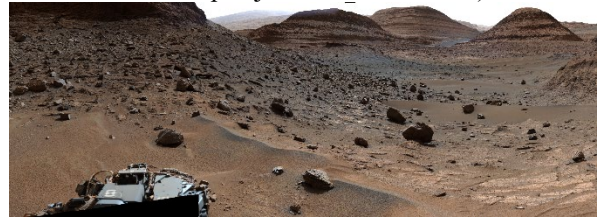
Fig. 2. Marker Band Valley looking south, Mastcam: sol03563 ML_102556 illustrating drifts, uneroded float blocks, and the scoured valley floor.

tend to have accumulations of dust, in contrast to the floors of the adjacent valleys (e.g. Murray Buttes and Buttes on Mt. Sharp adjacent to the traverse).