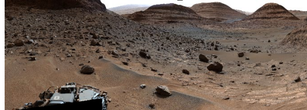
Fig. 2. Marker Band Valley looking south, Mastcam: sol03563 ML_102556 illustrating drifts, uneroded float blocks, and the scoured valley floor.

tend to have accumulations of dust, in contrast to the floors of the adjacent valleys (e.g. Murray Buttes and Buttes on Mt. Sharp adjacent to the traverse).